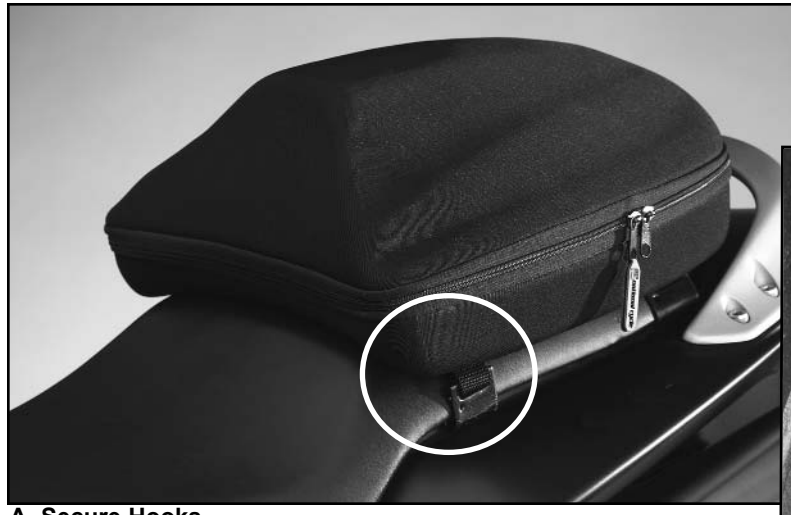
A. Secure Hooks

Check the tightness of the straps before riding. Never ride a motorcycle with loose equipment or accessories.