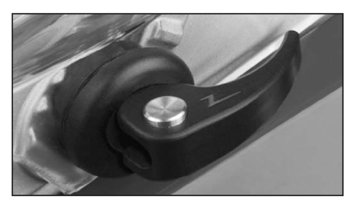
Optional Lever Action Rake Adjust Kit Z5200