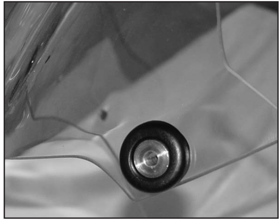
Figure 4 Showing Exterior Bushing